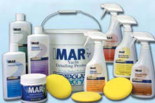
IMAR Captain's Bucket