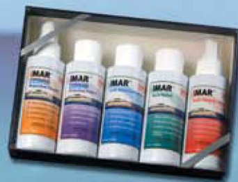
#43 IMAR 5 Gift Pak