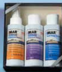
#42 IMAR Strataglass Gift Pak