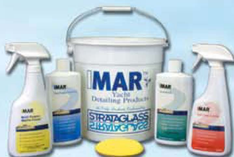
IMAR Mariner's Bucket