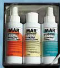
#71 IMAR Stamoid Gift Pak