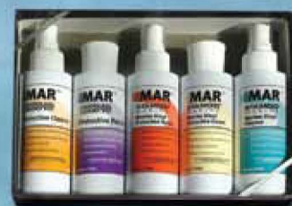
#72 IMAR Strataglass \ Stamoid Gift Pak