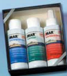
#41 IMAR 3 Gift Pak

Most Products are available in 4oz., 16oz. and 128oz. containers. Larger containers available upon request.