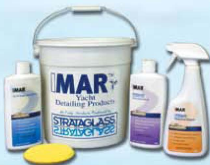
IMAR Strataglass Bucket