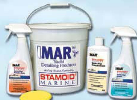
IMAR Stamoid Bucket